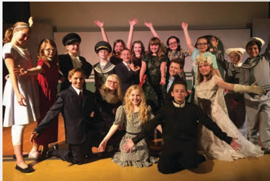
Jr Spring Production of Anything Goes 2016